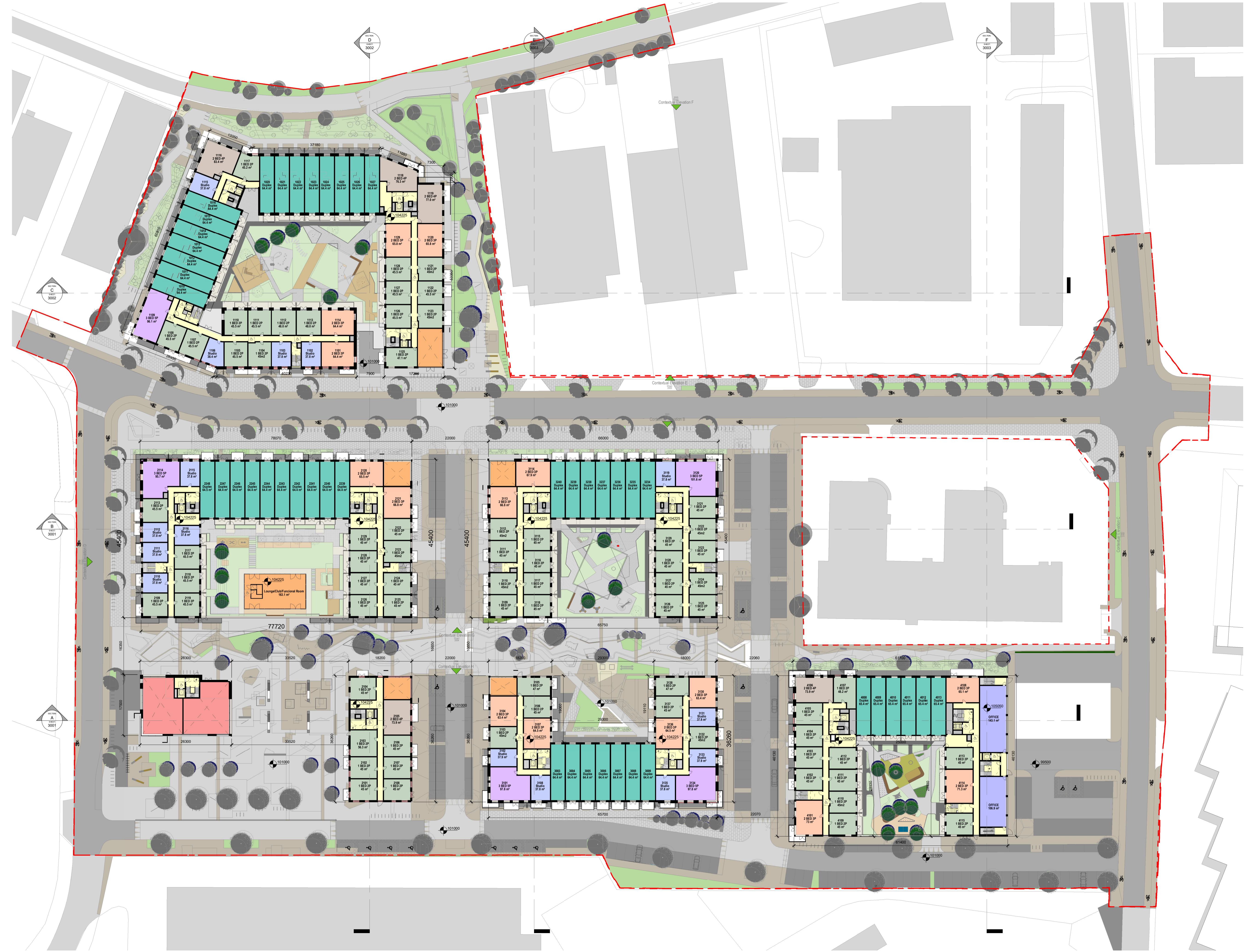
1 Plan - Level 01 1: 500

1 Sarsfield Quay, Arbour Hill, Dublin 7 t: 01 518 0170 e: admin@cwarchitects.ie Dublin | London | Warwick | Manchester www.cwarchitects.ie